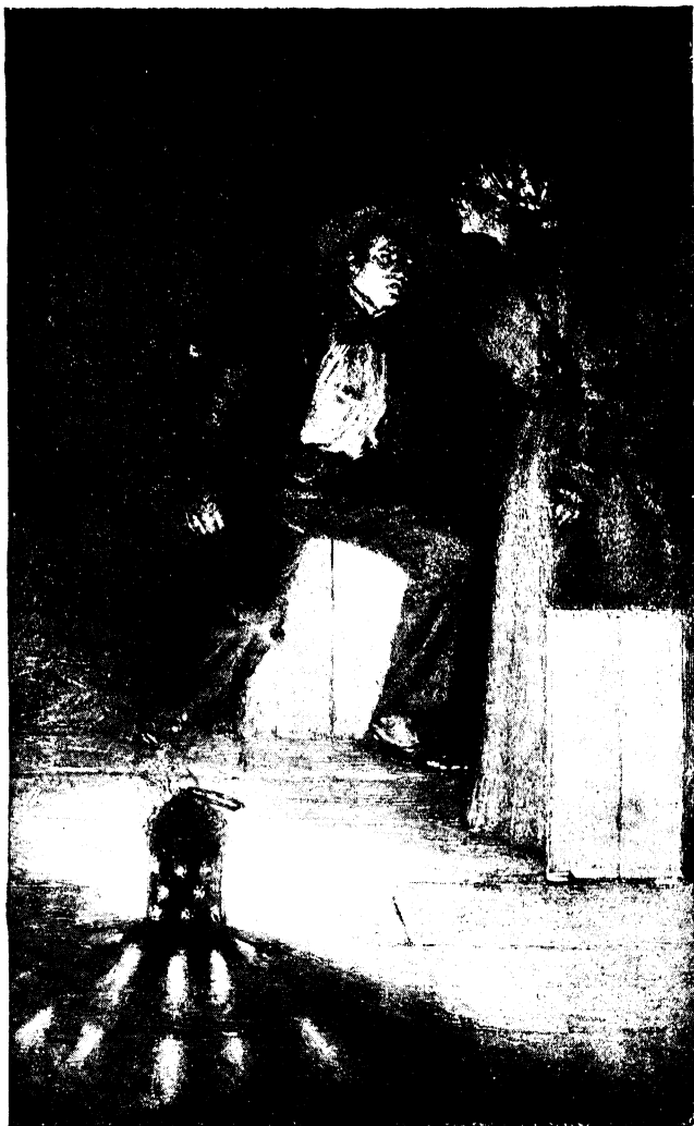
Her eyes flamed with triumph